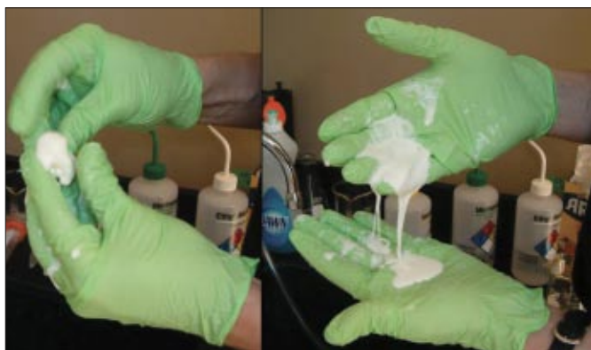
Fig. 1. A cornstarch-water mixture can be rolled around in your hand like a ball of soft clay (left), but will then flow like a liquid when you cease rolling it (right).

Squishy materials typically do not have a well-defined viscosity. To learn this in our class, students build towers of shaving cream, stir cornstarch and other solutions, and pour ketchup, although these also serve as good demonstrations. Short movies of these demon-