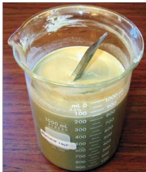
Fig. 2. A metal spatula stays inclined in a mixture of bentonite and water, suggesting it is an elastic material. Yet, when stirred by hand with the spatula, it stirs almost as easily as water.

Shear-Thickening Liquids: These have a low apparent viscosity when mixed slowly, but the viscosity grows dramatically when mixed quickly—in other words, the liquid “thickens” when shear is increased. Cornstarch is perhaps the most dramatic example: A mixture of ~50% by weight mixed with water can be rolled around in your hand like a ball of soft clay but will then flow like a liquid when you cease rolling it